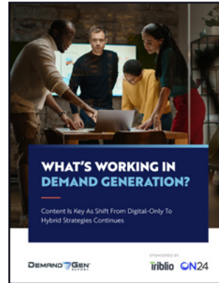
What's Working In Demand Generation?