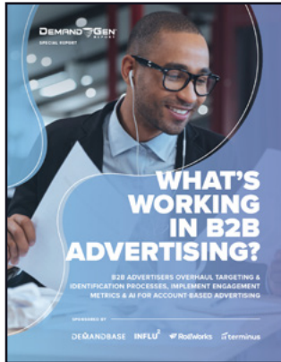
What's Working In B2B Advertising?